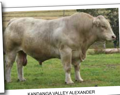
KANDANGA VALLEY ALEXANDER