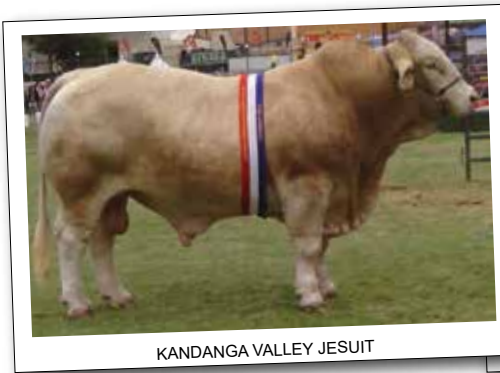
KANDANGA VALLEY JESUIT