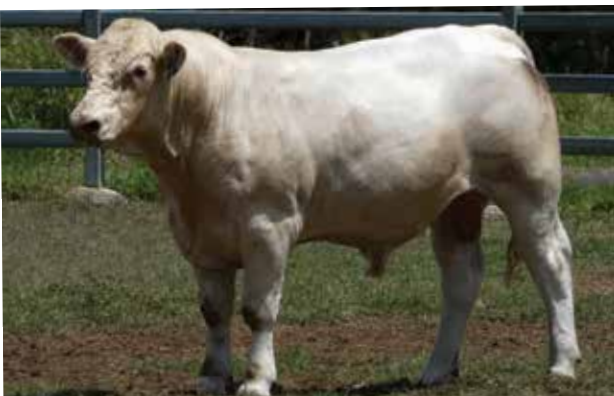
LOT 7: KANDANGA VALLEY TOM (P)