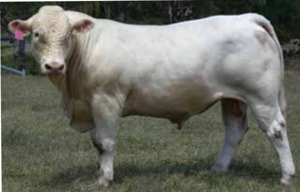
LOT 1: KANDANGA VALLEY TEAGZ