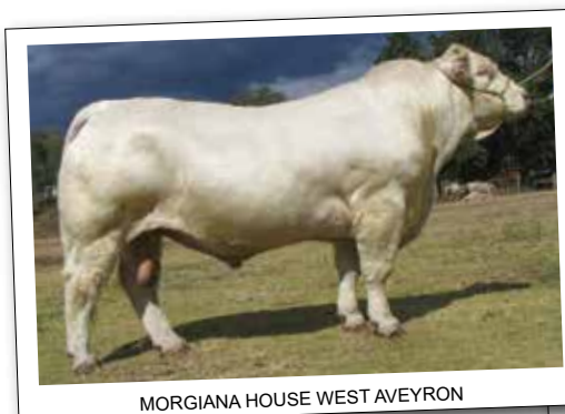
MORGIANA HOUSE WEST AVEYRON