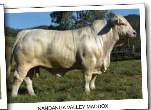
KANDANGA VALLEY MADDOX