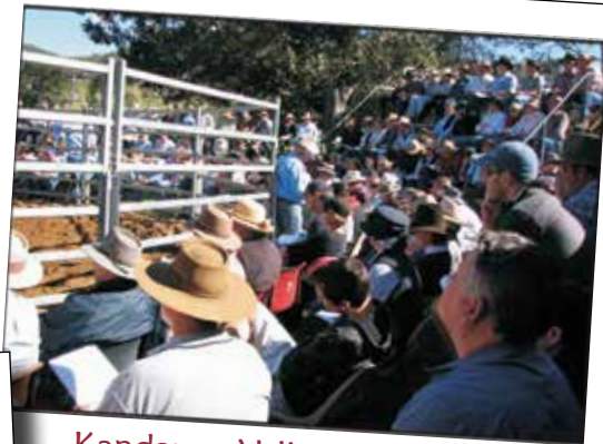
Kandanga Valley Sale Crowd

We are now running in excess of 1300 registered stud cattle, down from a peak of around 1700. We have put a big emphasis on fertility and productivity over the last few years as we have wound our herd back to a more manageable level.