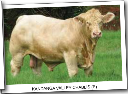
KANDANGA VALLEY CHABLIS (P)

Welcome friends to our 5th on property 'Summer' sale to be held at Warravale in the picturesque Kandanga Valley. Commencing at 10am (to beat the heat) we will present 70 beefy young bulls for your competition.