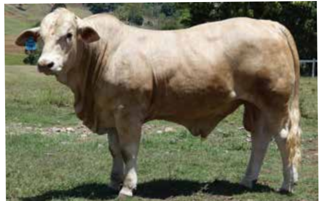
LOT 46: KANDANGA VALLEY TUXEDO (P)