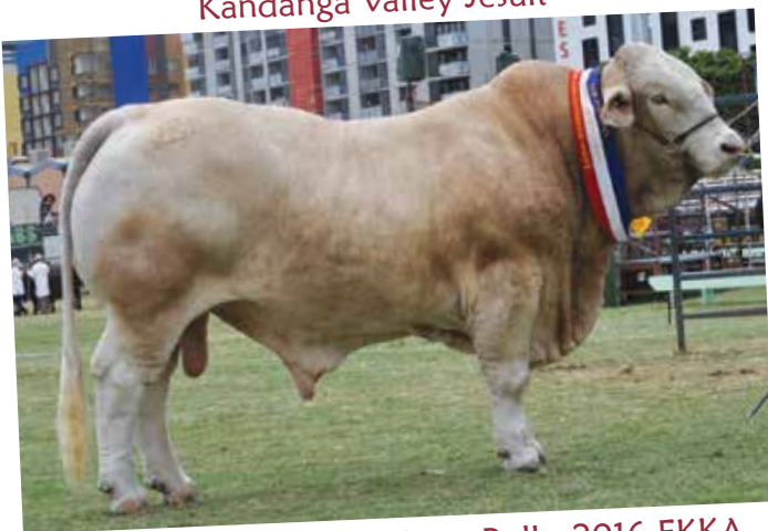
Grand Champion Charbray Bull - 2016 EKKA