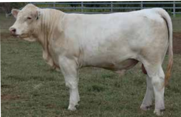
LOT 6: KANDANGA VALLEY TENNYSON (P)