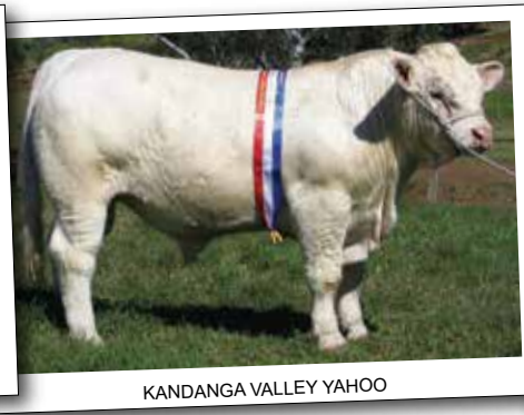
KANDANGA VALLEY YAHOO