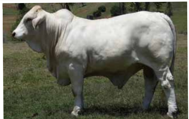
LOT 49: KANDANGA VALLEY TALGOONA