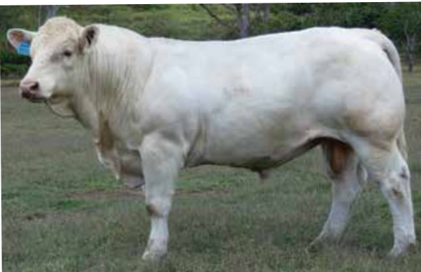
LOT 2: KANDANGA VALLEY TUCKER T51E