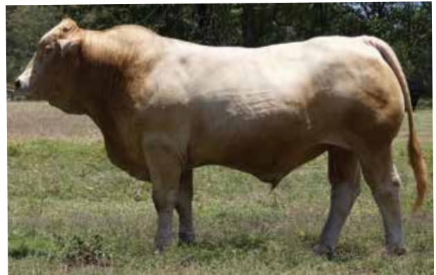
LOT 45: KANDANGA VALLEY TRENDSETTER (PS)