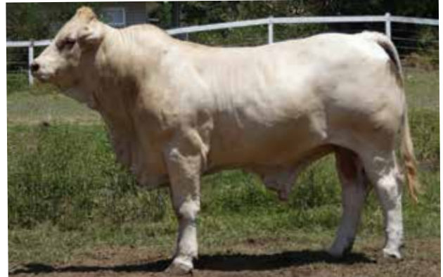
LOT 43: KANDANGA VALLEY TRIVAL